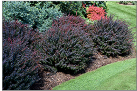
Sunjoy Mini Maroon Japanese Barberry

Sunjoy Mini Maroon Japanese Barberry is recommended for the following landscape applications;