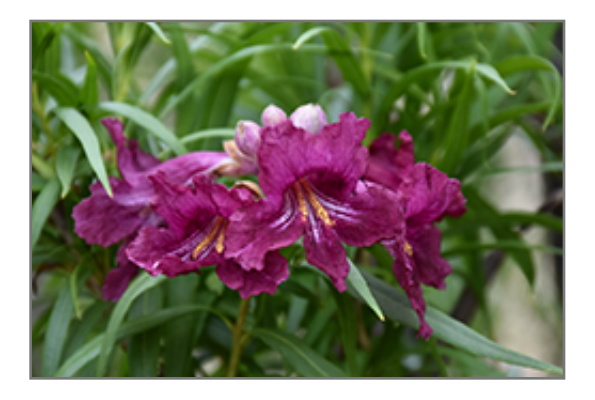
Burgundy Desert Willow flowers