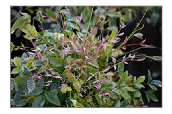
Twilight Nandina foliage