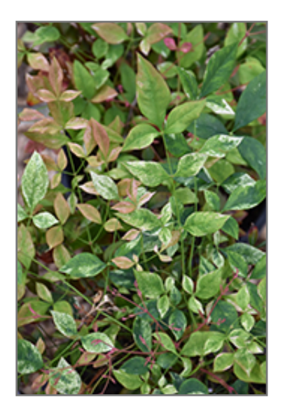
Twilight Nandina foliage