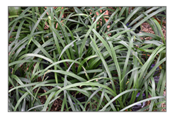
Crystal Falls Mondo Grass foliage