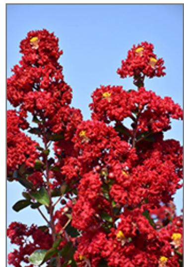
Double Dynamite Crapemyrtle flowers