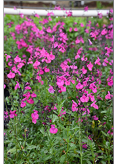
Raspberry Autumn Sage flowers

This is a relatively low maintenance plant, and should only be pruned after flowering to avoid removing any of the current season's flowers. It is a good choice for attracting bees, butterflies and hummingbirds to your yard, but is not particularly attractive to deer who tend to leave it alone in favor of tastier treats. It has no significant negative characteristics.