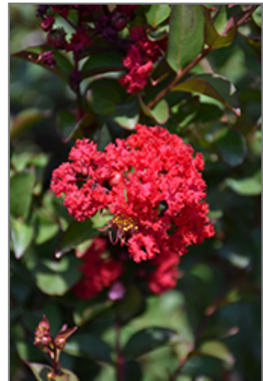
Princess Zoey Crapemyrtle flowers