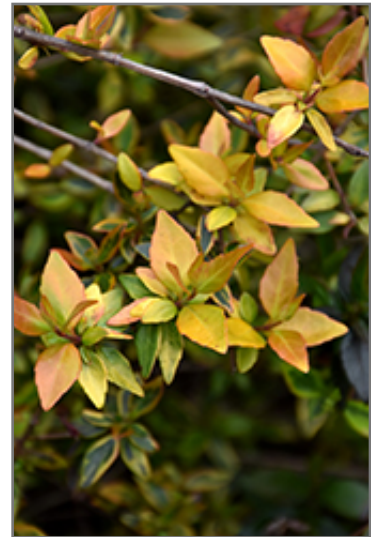
Gold Dust Abelia foliage

Gold Dust Abelia is recommended for the following landscape applications;