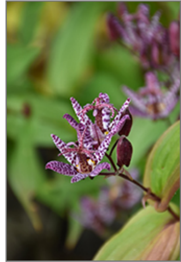
Toad Lily flowers