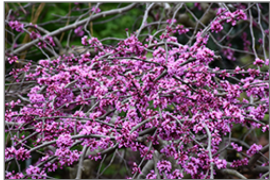
Traveller Weeping Redbud flowers