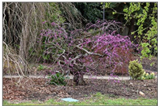
Traveller Weeping Redbud in bloom