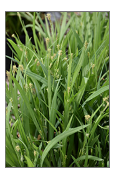
Bunny Blue Sedge foliage