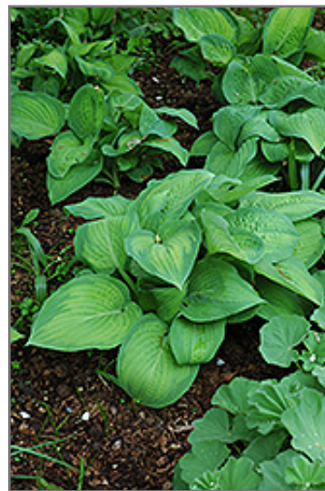
Paul's Glory Hosta