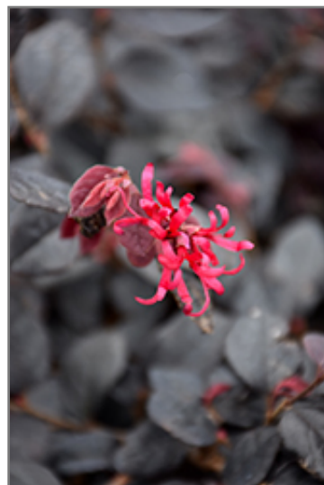
Cherry Blast Fringeflower flowers