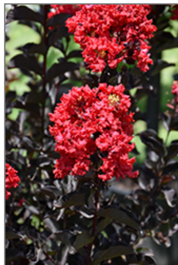
Ebony Fire Crapemyrtle flowers