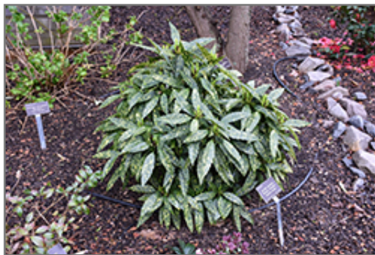
Hosoba Hoshifu Aucuba