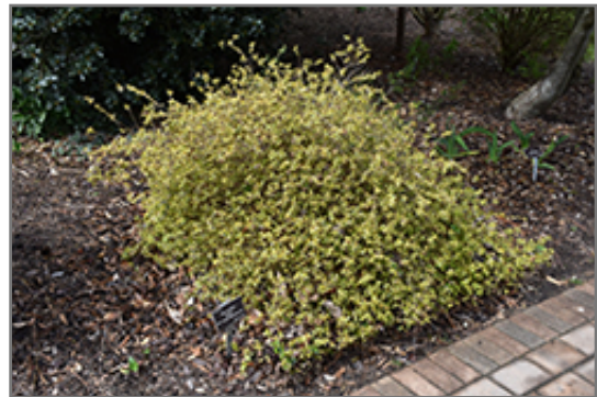
Twist of Orange Glossy Abelia