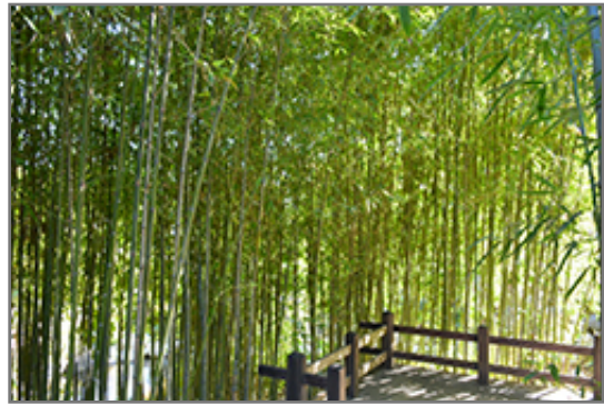
Golden Bamboo