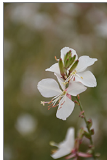
Geyser White Gaura flowers

Geyser White Gaura is recommended for the following landscape applications;