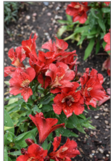
Colorita Kate Alstroemeria flowers