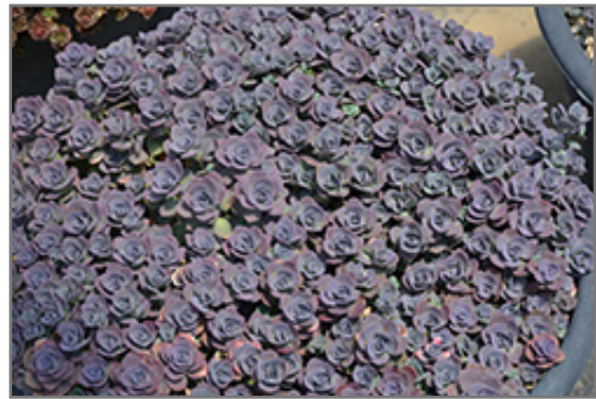
SunSparkler Blue Elf Sedoro