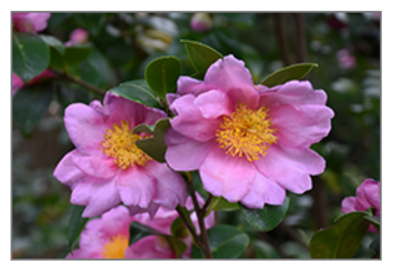
Autumn Pink Icicle Camellia flowers

Autumn Pink Icicle Camellia features showy rose round flowers with gold eyes at the ends of the branches from mid to late fall. It has dark green evergreen foliage. The glossy pointy leaves remain dark green throughout the winter.