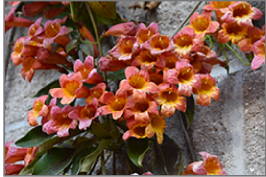
Tangerine Beauty Cross Vine flowers

Tangerine Beauty Cross Vine will grow to be about 30 feet tall at maturity, with a spread of 3 feet. As a climbing vine, it tends to be leggy near the base and should be underplanted with low-growing facer plants. It should be planted near a fence, trellis or other landscape structure where it can be trained to grow upwards on it, or allowed to trail off a retaining wall or slope. It grows at a fast rate, and under ideal conditions can be expected to live for approximately 20 years.