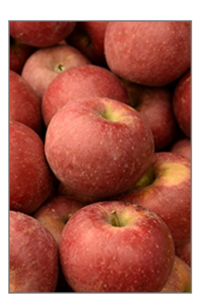
Winesap Apple fruit