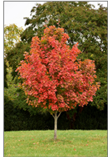
John Pair Sugar Maple in fall