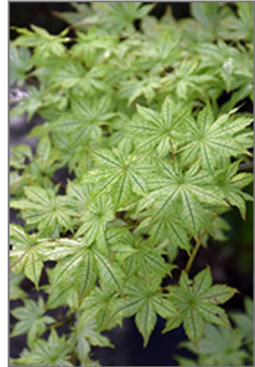
Shigitatsu Sawa Japanese Maple foliage