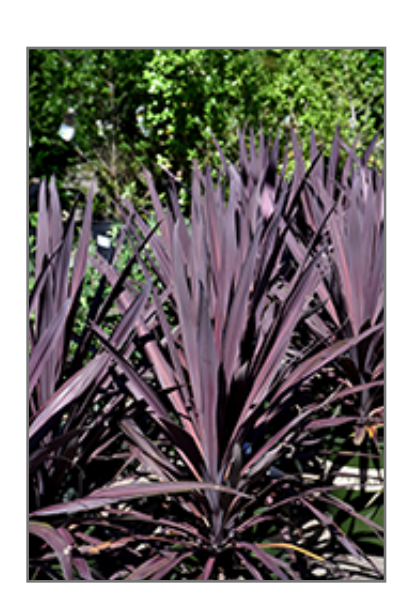
Bauer's Cordyline

When grown indoors, Bauer's Cordyline can be expected to grow to be about 6 feet tall at maturity, with a spread of 3 feet. It grows at a medium rate, and under ideal conditions can be expected to live for approximately 10 years. This houseplant will do well in a location that gets either direct or indirect sunlight, although it will usually require a more brightly-lit environment than what artificial indoor lighting alone can provide. It does best in average to evenly moist soil, but will not tolerate standing water. The surface of the soil shouldn't be allowed to dry out completely, and so you should expect to water this plant once and possibly even twice each week. Be aware that your particular watering schedule may vary depending on its location in the room, the pot size, plant size and other conditions; if in doubt, ask one of our experts in the store for advice. It is not particular as to soil type or pH; an average potting soil should work just fine.