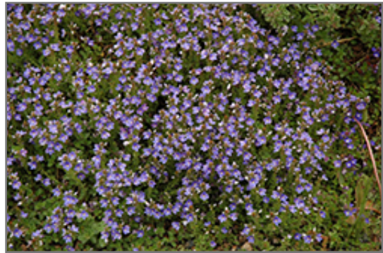
Turkish Speedwell in bloom

Turkish Speedwell is recommended for the following landscape applications;