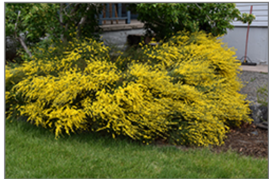
Spanish Gold Broom in bloom