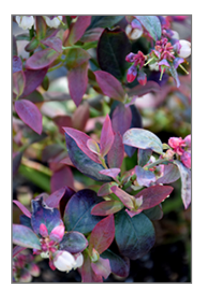
Pink Icing Blueberry foliage