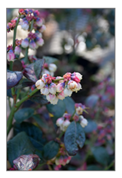
Pink Icing Blueberry flowers

This shrub is quite ornamental as well as edible, and is as much at home in a landscape or flower garden as it is in a designated edibles garden. It does best in full sun to partial shade. It does best in average to evenly moist conditions, but will not tolerate standing water. It may require supplemental watering during periods of drought or extended heat. It is very fussy about its soil conditions and must have sandy, acidic soils to ensure success, and is subject to chlorosis (yellowing) of the foliage in alkaline soils. It is quite intolerant of urban pollution, therefore inner city or urban streetside plantings are best avoided, and will benefit from being planted in a relatively sheltered location. Consider applying a thick mulch around the root zone in winter to protect it in exposed locations or colder microclimates. This particular variety is an interspecific hybrid.