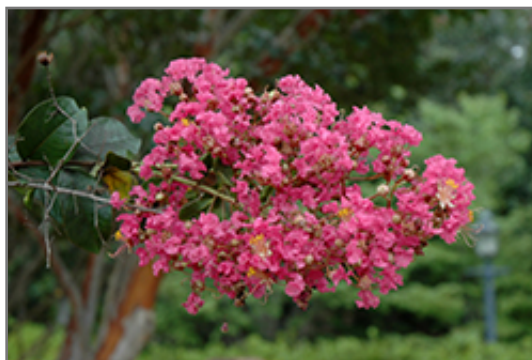
Watermelon Red Crapemyrtle flowers

Watermelon Red Crapemyrtle is recommended for the following landscape applications;