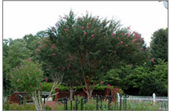
Watermelon Red Crapemyrtle in bloom

This tree does best in full sun to partial shade. It prefers to grow in average to moist conditions, and shouldn't be allowed to dry out. It may require supplemental watering during periods of drought or extended heat. It is very fussy about its soil conditions and must have rich, acidic soils to ensure success, and is subject to chlorosis (yellowing) of the foliage in alkaline soils. It is highly tolerant of urban pollution and will even thrive in inner city environments. This is a selected variety of a species not originally from North America.