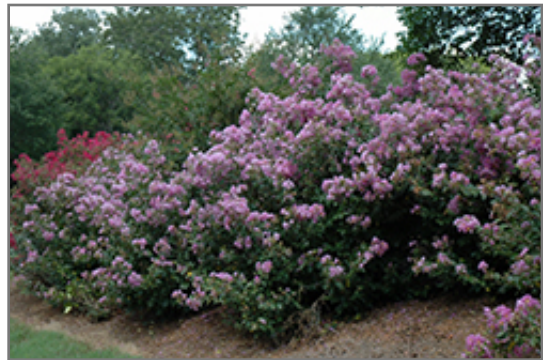
Cordon Bleu Crapemyrtle in bloom