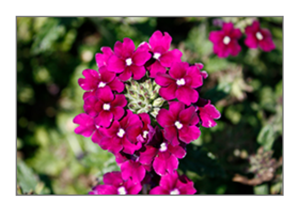
EnduraScape Purple Verbena flowers