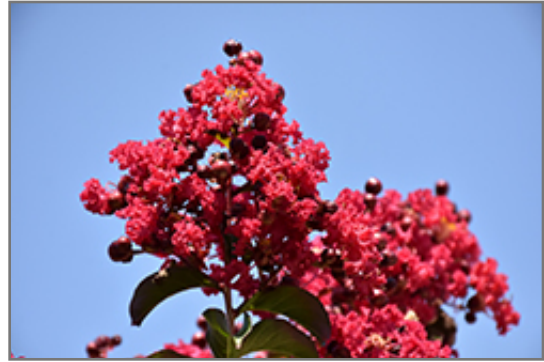
Centennial Spirit Crapemyrtle flowers