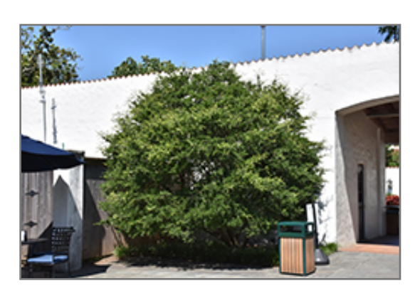
Yaupon Holly