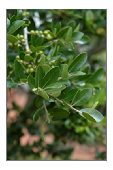
Yaupon Holly foliage