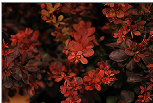
Sunjoy Mini Salsa Japanese Barberry foliage

Sunjoy Mini Salsa Japanese Barberry will grow to be about 24 inches tall at maturity, with a spread of 24 inches. It tends to fill out right to the ground and therefore doesn't necessarily require facer plants in front. It grows at a slow rate, and under ideal conditions can be expected to live for approximately 20 years.