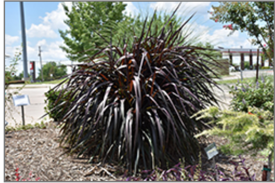
Princess Caroline Fountain Grass

Princess Caroline Fountain Grass is recommended for the following landscape applications;