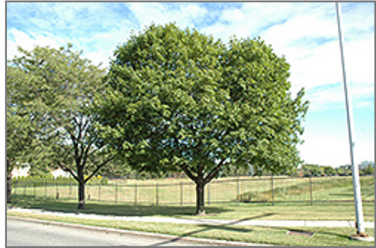
Norway Maple