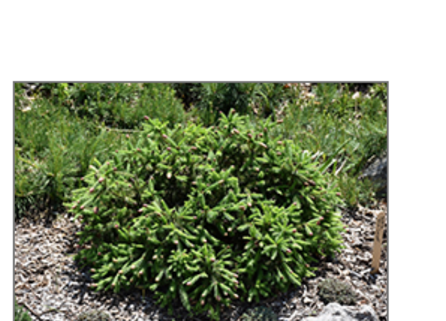
Pusch Spruce