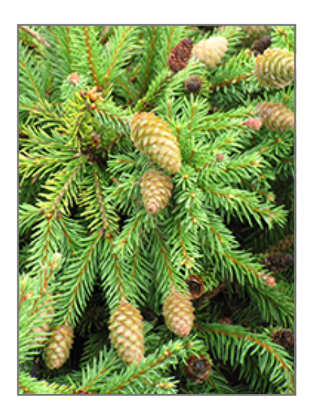
Pusch Spruce foliage