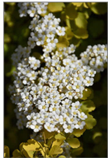
Glow Girl Birch Leaf Spirea flowers