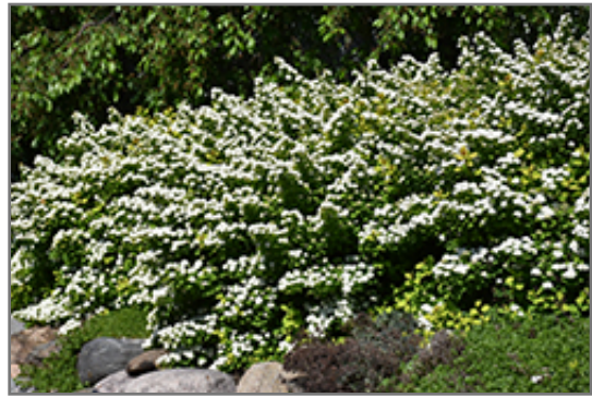
Glow Girl Birch Leaf Spirea in bloom

Glow Girl Birch Leaf Spirea is recommended for the following landscape applications;