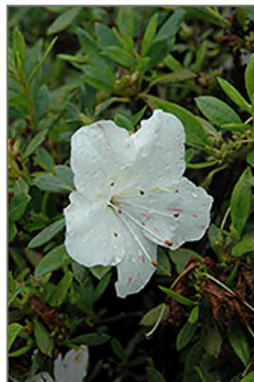
Encore Autumn Starlite Azalea flowers