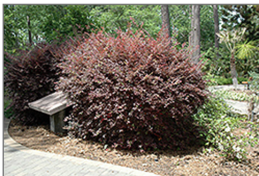
Daruma Chinese Fringeflower