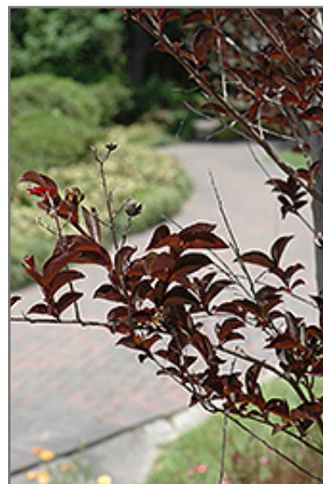
Delta Jazz Crapemyrtle foliage

Delta Jazz Crapemyrtle makes a fine choice for the outdoor landscape, but it is also well-suited for use in outdoor pots and containers. Its large size and upright habit of growth lend it for use as a solitary accent, or in a composition surrounded by smaller plants around the base and those that spill over the edges. It is even sizeable enough that it can be grown alone in a suitable container. Note that when grown in a container, it may not perform exactly as indicated on the tag - this is to be expected. Also note that when growing plants in outdoor containers and baskets, they may require more frequent waterings than they would in the yard or garden.