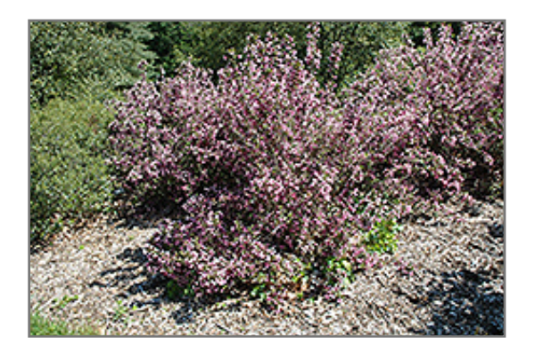
Java Red Weigela in bloom