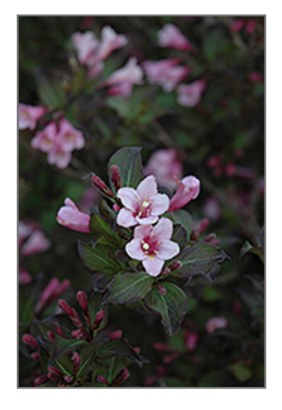
Java Red Weigela flowers