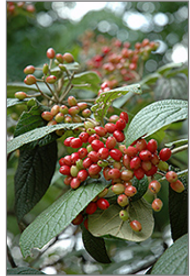
Alleghany Viburnum fruit

This shrub does best in full sun to partial shade. It prefers to grow in average to moist conditions, and shouldn't be allowed to dry out. It may require supplemental watering during periods of drought or extended heat. It is not particular as to soil type or pH. It is highly tolerant of urban pollution and will even thrive in inner city environments. This particular variety is an interspecific hybrid.