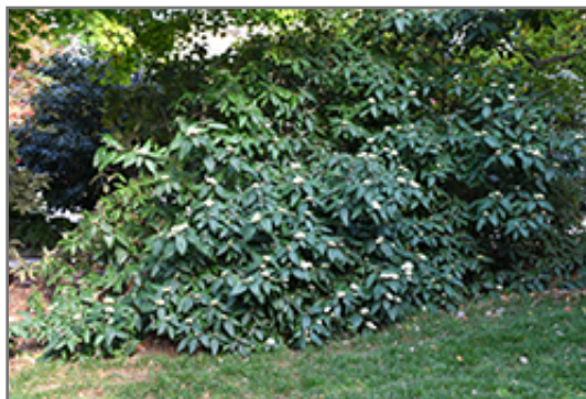
Alleghany Viburnum in bloom