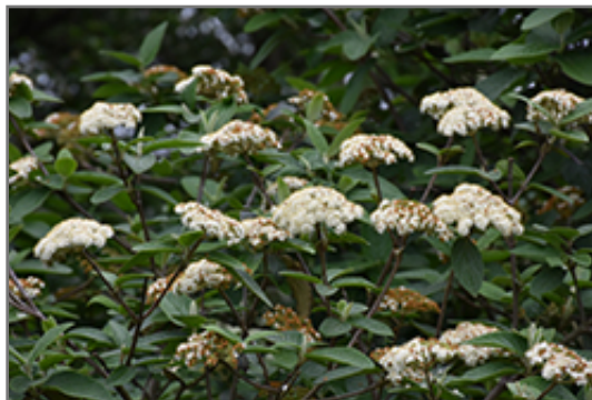
Alleghany Viburnum flowers

Alleghany Viburnum is recommended for the following landscape applications;