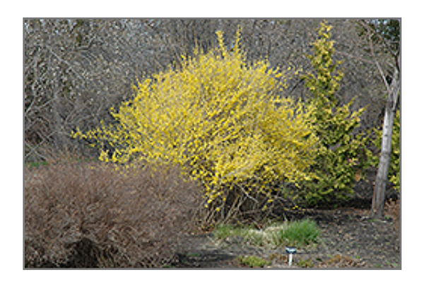
Northern Gold Forsythia in bloom

This is a relatively low maintenance shrub, and should only be pruned after flowering to avoid removing any of the current season's flowers. Deer don't particularly care for this plant and will usually leave it alone in favor of tastier treats. It has no significant negative characteristics.