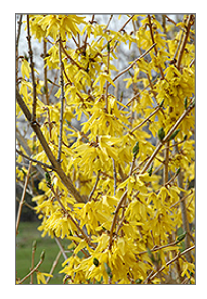
Northern Gold Forsythia flowers

Northern Gold Forsythia is recommended for the following landscape applications;