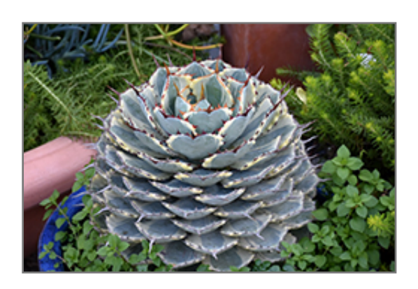
Kissho Kan Agave