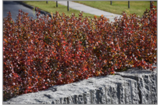
Gro-Low Fragrant Sumac in fall

This shrub performs well in both full sun and full shade. It is very adaptable to both dry and moist locations, and should do just fine under typical garden conditions. It may require supplemental watering during periods of drought or extended heat. It is not particular as to soil type, but has a definite preference for acidic soils, and is subject to chlorosis (yellowing) of the foliage in alkaline soils. It is highly tolerant of urban pollution and will even thrive in inner city environments. Consider applying a thick mulch around the root zone in winter to protect it in exposed locations or colder microclimates. This is a selection of a native North American species.