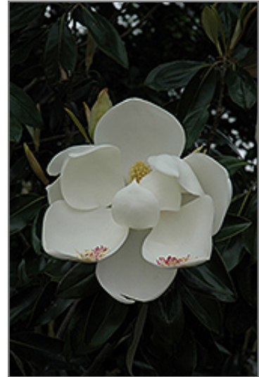
Teddy Bear Magnolia flowers