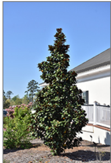
Teddy Bear Magnolia