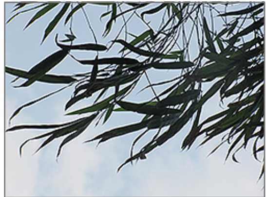
Chinese Goddess Bamboo foliage