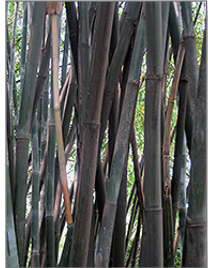
Chinese Goddess Bamboo bark

Chinese Goddess Bamboo is recommended for the following landscape applications;