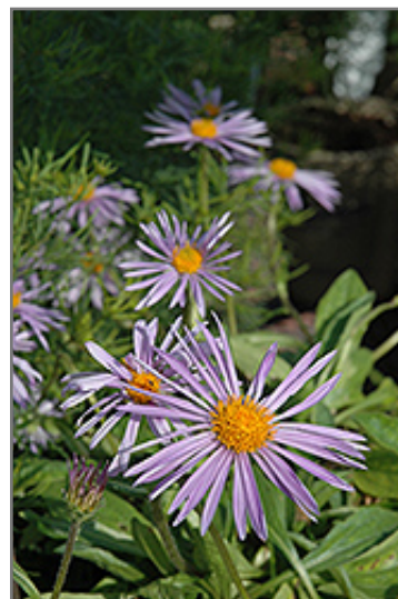
Triumph Aster flowers